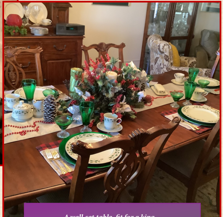
A well-set table, fit for a king...