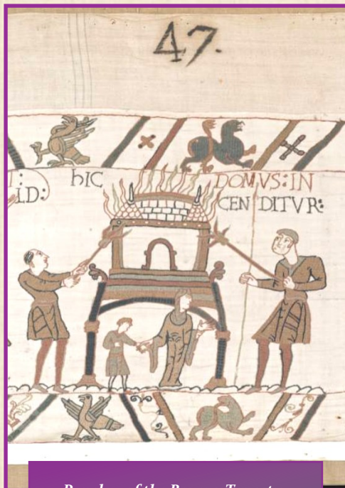
Panel 47 of the Bayeux Tapestry

Click here to watch a short film trailer which tells the story of our discovery far better than my ramblings ever could!